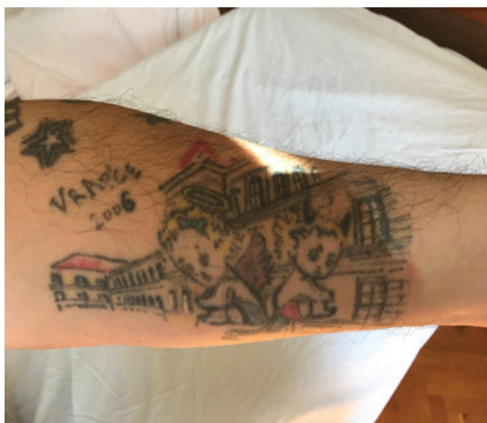
SLIKA 5. Anđeo i vrag ispred glavne zgrade Bolnice Vrapče FIGURE 5. Angel and devil in front of the main building of Hospital Vrapče