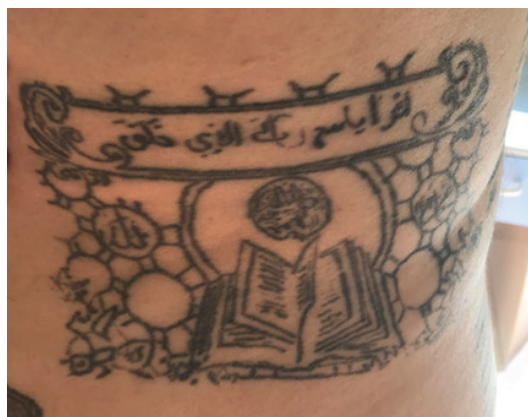
SLIKA 2. Tetovaža s religioznim motivom FIGURE 2. Religious motifs on a tattoo

The patient's body is covered in many religious motifs. In-between the four texts that the patient called his biography, there is a tattoo of a mosque and a crescent moon and a star. This can lead us to a conclusion is central to his life, given that the tattoo of a mosque is positioned in the centre between several texts. There are several quotations from the Koran as well as a tattoo of the holy book (Figure 2). Also, there are several beads and symbols of a crescent moon and a star in several places on the patient's body. The motif of death is repeated several times as evidenced by the inscriptions “You die once” and “I don't care about life.” There are also several tattoos of grenades and a coffin where a tattooed gun with the date 20 May 2012 stands out in particular (Figure 3). The patient explained that