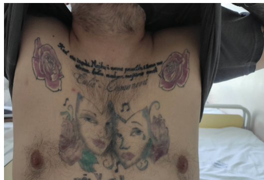
SLIKA 4. Tetovaža tužne i sretne maske FIGURE 4. A tattoo of the happy and sad face mask

Nadalje, naznačen je i motiv podvojenosti, koji je vidljiv iz tetovaže tužne i sretne maske (slika 4.) te iz jedne od najzanimljivijih tetovaža – anđela i vraga ispred Klinike za psihijatriju Vrapče, uz koji je napisana godina 2006. (slika 5.). Objašnjava da je tetovaža nastala nakon jednog od hospitalnih liječenja, otprilike desetak dana nakon otpusta iz bolnice. Opisuje da se na tu tetovažu odlučio zato što je „čitav život u bolnici Vrapče“, referirajući se na učestale hospitalizacije u Klinici. Dodaje da je njemu lijepo u Bolnici te da je to jedan od razloga zašto se odlučio baš na tu tetovažu. Godina 2006. nije godina kada je nastala tetovaža nego označava godinu kada se prvi puta počeo liječiti u Bolnici. Nikada nije liječen ni u jednoj drugoj bolnici niti bi to htio. Ispred bolnice su nacrtana dva anđela, za koje navodi da je jedan dobar, a drugi loš, jer „to tako obično biva u životu“. Vezana uz pacijentovo psihijatrijsko liječenje jest i tetovaža u kojoj je nacrtana kocka za igranje u plamenu, ispod koje piše „Kocka je zlo.“ (slika 6). Dio je to pacijentove ispovijesti, objašnjava da je „nekoć mnogo kockao, a već dulje od deset godina ne kocka“. Upravo zbog ponosa što je uspio prestati kockati, odlučio se baš za tu tetovažu.