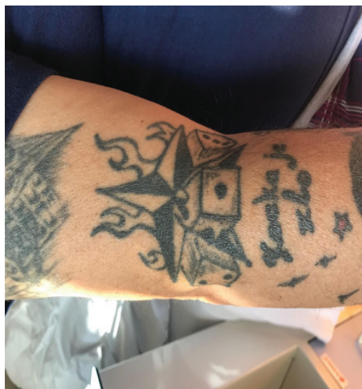
SLIKA 6. Kocka za igranje u plamenu FIGURE 6. A dice in flames