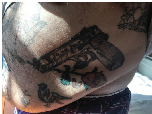
SLIKA 3. Tetovaža pištolja FIGURE 3. Gun tattoo

na kojoj je ispisan datum 20.5.2012. (slika 3.). Bolesnik objašnjava da je toga dana pokušao suicid tako što je pištoljem prostrijelio vlastitu potkoljenu.